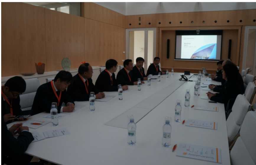
Meeting in the new i.lab