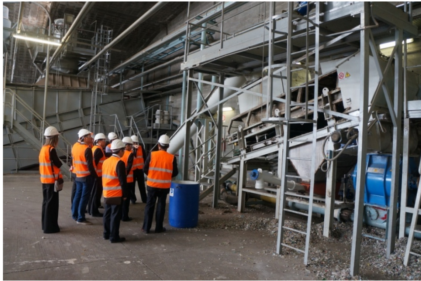
Visit in Calusco cement plant