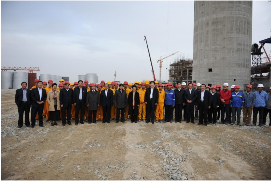
Group photo in Yutian Plant